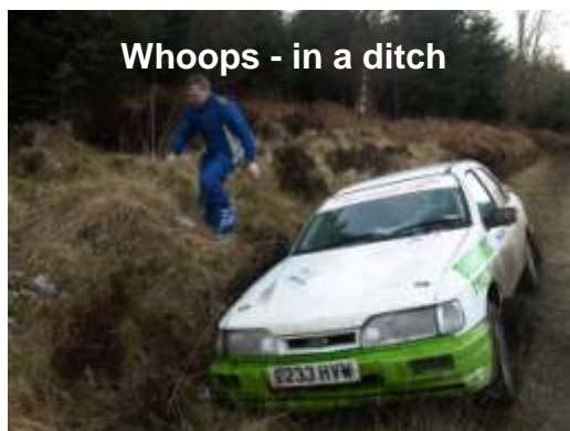
Whoops - in a ditch