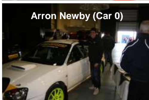
Arron Newby (Car 0)