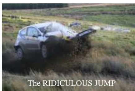
The RIDICULOUS JUMP

All ready to start the Rally GB national on Friday morning, last event of a tough busy year for the team, but not without it's rewards with two championships in the bag. Some hard graft done by the lads to rebuild the Team Protec Evo IX of Tom Naughton & Horace Saville, following their mishap on the Cambrian rally with a very large log pile ! They are running at car 208. The Team are through today's stages and now heading into service to get the car ready for tomorrow. Good run today, fast pace but tricky slippery conditions, happy to end the day in 7th O/a, But need a big push tomorrow to climb up the leader board. Frustrating end to our rally season on Rally GB, our crew fell victim of the ridiculous jump on Sweet Lamb, totally unnecessary not to warn the crews at the stage start Team out of the rally and caused thousands of £££ of damage for sod all !!!!