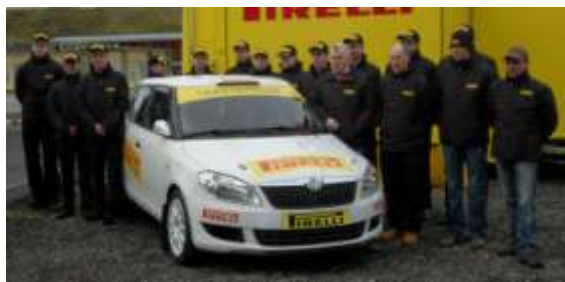
The 'Pirelli Star Driver' Candidates & Judges