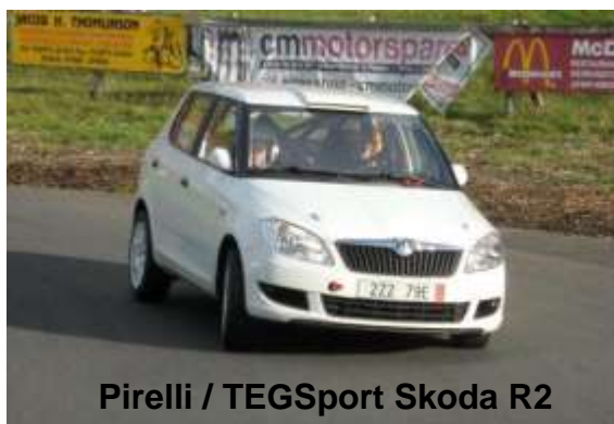
Pirelli / TEGSport Skoda R2