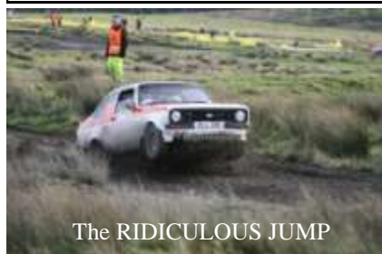
The RIDICULOUS JUMP

Tickets £8.00 each - available from Dave Nolan 07970 9453898