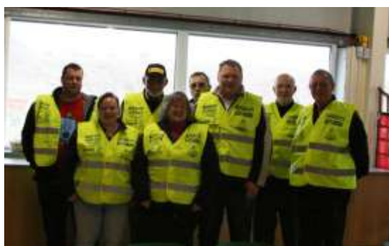
The Gemini Marshalling Crew